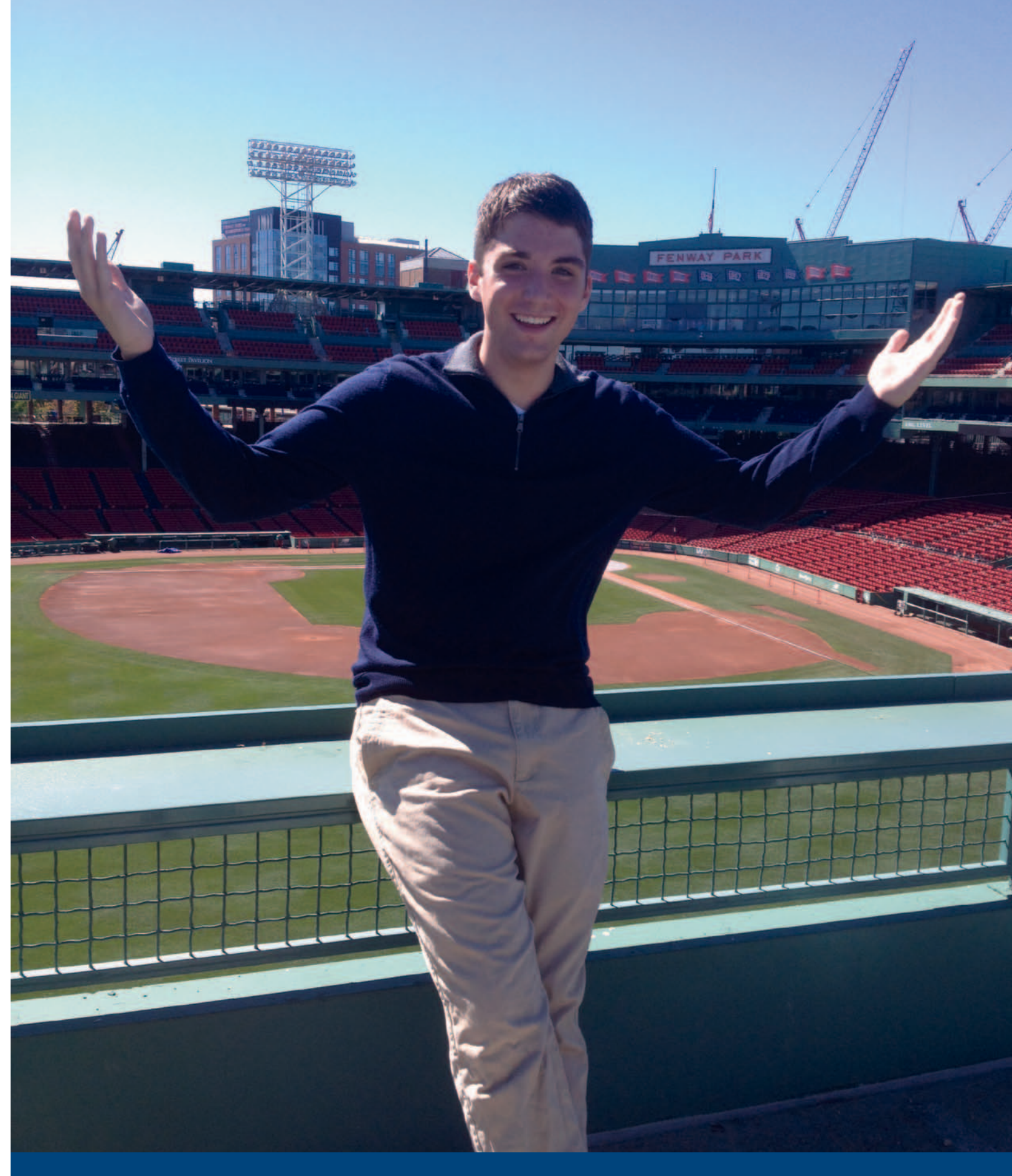
Talk show host Robert Way visits Fenway Park.