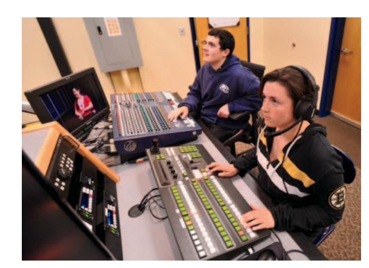
The crew works in the control room.

The shows continued, and the next guest who appeared Continued on next page