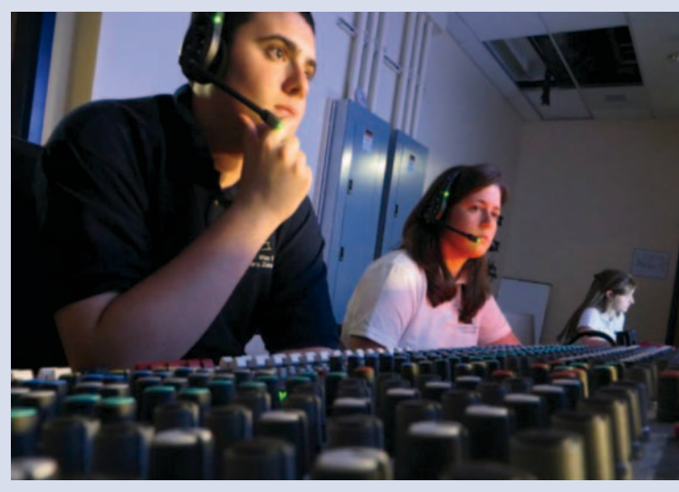
The crew works in the control room